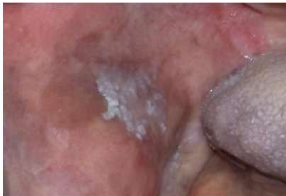
Fig. 2 Leukoplakia of right buccal mucosa