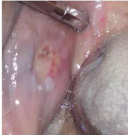
Fig. 4 Very good healing progress on 7 th postop day