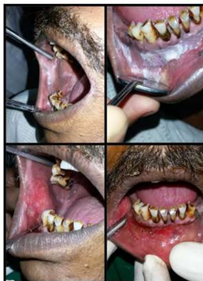
Fig. 6 Immediate postop after leukoplakia ablation from buccal and labial mucosa