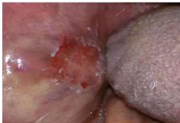
Fig. 3 Immediate postop