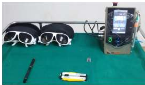
Fig. 1 Diode laser unit