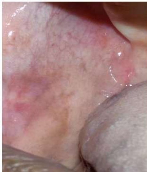
Fig. 5 Complete healing after 30 days